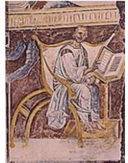
Above: Augustine of Hippo as depicted in a painting in the Lateran Church in Rome ( ca 400-500 C.E.).