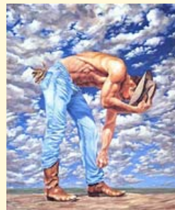
Like Brokeback Mountain , Atlas by prominent American artist Delmas Howe renders the unspoken homoeroticism of the Cowboy explicit.

Brokeback Mountain also reminds Americans of the persistent, though usually unmentioned, element of homoeroticism in representations of the Cowboy. In contrast to most male clothing, Western styles accentuate and decorate the male body, encasing it in form-fitting denim and leather, often with strikingly ornate leather and metal work such as chaps, buckles, and conchos. Western movies not only present male bodies in Cowboy finery, but display them in action, frequently in the course of their stories only partly dressed, as when the hero washes or recovers from his fights and other ordeals.