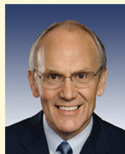
Public inquiries into his toilet habits made Sen. Larry Craig (R-Idaho) an object of national hilarity in 2007.

Finally, consider the grotesque mess in which Larry Craig, the ultra-right-wing U. S. Senator from Idaho, embroiled himself in the summer of 2007. The American public was given the bizarre entertainment of transcripts and tape recordings in which a senior member of the nation's highest legislative body tried to describe and explain his toilet habits to police. Some have rightly pointed out that the arrest raises important questions about apparent entrapment practices by police, but that has not prevented Craig, who first announced his resignation and then refused to resign, from becoming an object of national hilarity.