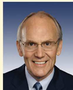
Public inquiries into his toilet habits made Sen. Larry Craig (R-Idaho) an object of national hilarity in 2007.

Finally, consider the grotesque mess in which Larry Craig, the ultra-right-wing U. S. Senator from Idaho, embroiled himself in the summer of 2007. The American public was given the bizarre entertainment of transcripts and tape recordings in which a senior member of the nation's highest legislative body tried to describe and explain his toilet habits to police. Some have rightly pointed out that the arrest raises important questions about apparent entrapment practices by police, but that has not prevented Craig, who first announced his resignation and then refused to resign, from becoming an object of national hilarity.