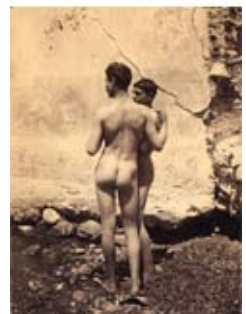
A self-portrait by Wilhelm von Gloeden (1891, top) and three photographs he created of Sicilian youths.